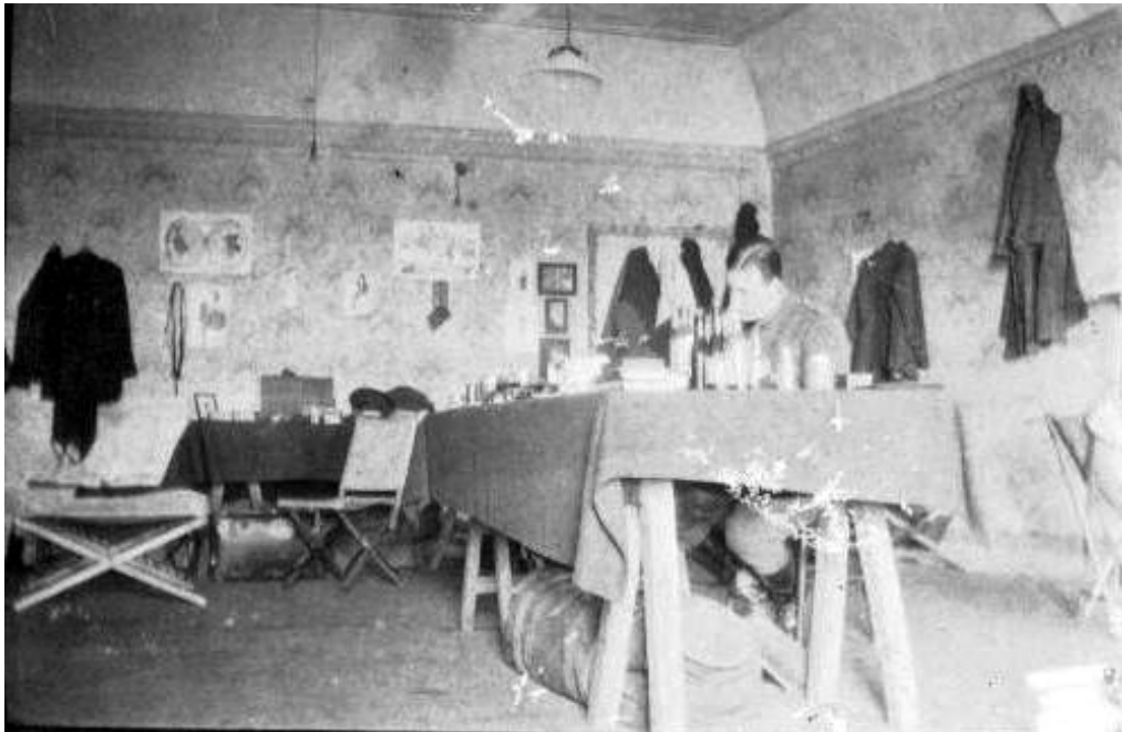
Taken during his time on the front line